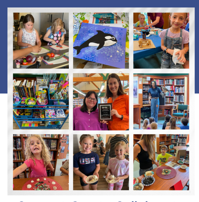
Connect. Create. Collaborate.