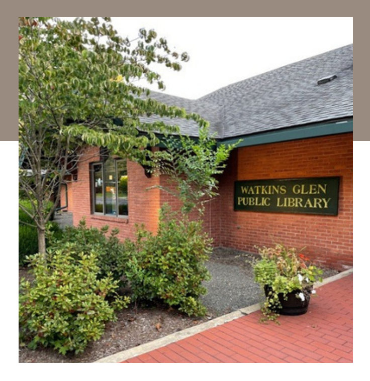
Connect. Create. Collaborate.