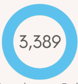
Attendance at Early Literacy Programs