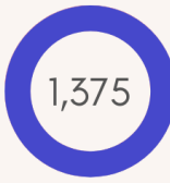
Attendance at Teen and Young Adult Programs