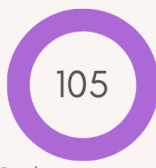
Students registered for the annual Summer Learning Program