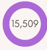
Children's and Young Adult Books