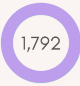
Attendance at Adult and General Interest Programs