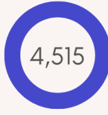
Audiobooks, DVDs, Magazines, and Kits